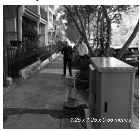
First Node, a Tfan to connect 400 households lands in Hopetoun St, no consutation, 15 possible in Paddington

• Once the NBN box arrives then it is up to you to manage what happens inside your home or office. You need to organise the actual connection to the internet (as with ADSL+) via your preferred ISP - Telstra, Optus, iiNet, TPG, Foxtel, iPrimus, InternetOn, Dodo. NBN Co lists 147 potential ISP suppliers on their website just for Paddington.