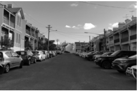
Suffolk Street after (new trees have now been planted)

There are bushland trails through the park, a mix of hard dirt and asphalt. It is also dog friendly, with off and on leash dog areas. The bush walking trails are off leash but the area around the playground is on leash and dogs should be kept clear of the oval as well. About halfway along the main bush track is a charming little pond with ducks and other water fowl and some bench seats on which to sit and relax.