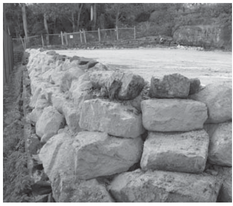
Progress on the Community Garden site.

The community garden, next to the tennis courts in Trumper Park, is really taking shape. Once the fence is in place, sleepers will be installed to form the raised beds and we can start gardening. The response has been huge with over 100 enquiries for membership!