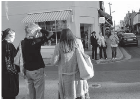
Shoppers in William Street

William Street has become one of our most vibrant streets over the last few years with the increase of boutique shops moving into the residential terraces. To retain the character of the street, which is the reason why it's so popular, the original façades must be kept intact with no changes to the shape of the windows, doors or balconies, and signage is to be discreet. The street is zoned residential. Council is currently reviewing zoning options to accommodate retail use. The Society believes a mix of retail at ground level with residential upstairs would be the best solution. However, we are quite concerned about the appearance of security grilles on the outside of buildings.