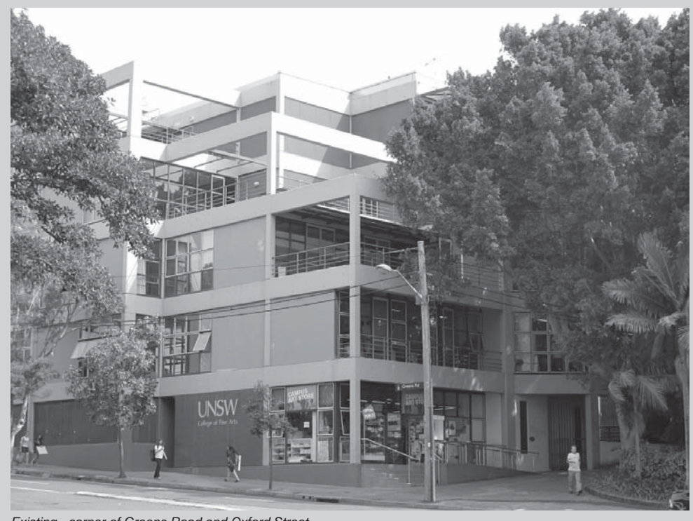
Existing - corner of Greens Road and Oxford Street.

The community campaigned for a Masterplan to be developed for the entire site. In June 2004 the UNSW announced that the University and the City of Sydney would work together on this strategy in consultation with the community. In April 2006 the Masterplan DCP was approved by Council and by 2008 community meetings were held to discuss the development